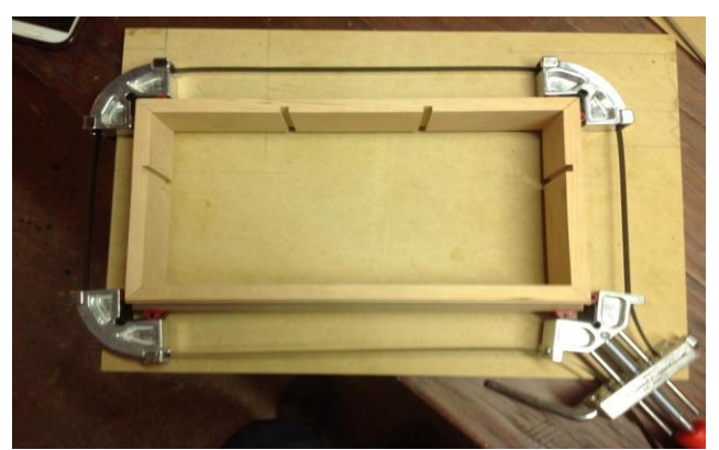
Merle Multi-Corner Clamp Copyright 2015. MLCS Woodworking. Page 3

Before glue up and assembly of the box body, make sure to give the interior a good sanding. This is imperative because it will be very difficult to do so after assembly. With the interior sanded, the box can be glued up. Before applying any glue, roughly expand the Merle Clamp band to a size that is just slightly larger than the overall length and width of the box. Position the adjustable corners in their approximate locations along the steel banding. The pivoting corner inserts can be removed from the Merle Corner clamp to help you produce a square glue up or left in place, as long as you check for square after the clamp is tightened. Apply glue to mitered ends and assemble the box. A piece of masking tape can act as a second set of hands to hold the pieces together as you fit each corner together. Place the box into the clamp and turn the handle to apply enough pressure to hold the parts together, making sure the corner profiles are matching up properly. Once you have all four corners secured, check the box to make sure it is square and make any adjustments needed to maintain a square box. At this point it is safe to put the box body aside and allow the glue adequate drying time.